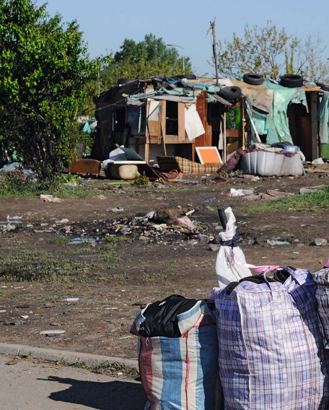
Eviction of the Roma settlement at Belville, Belgrade, April, 2012. / Raseljavanje romskog naselja kod Belvila od strane gradske vlasti, Beograd, april 2012.