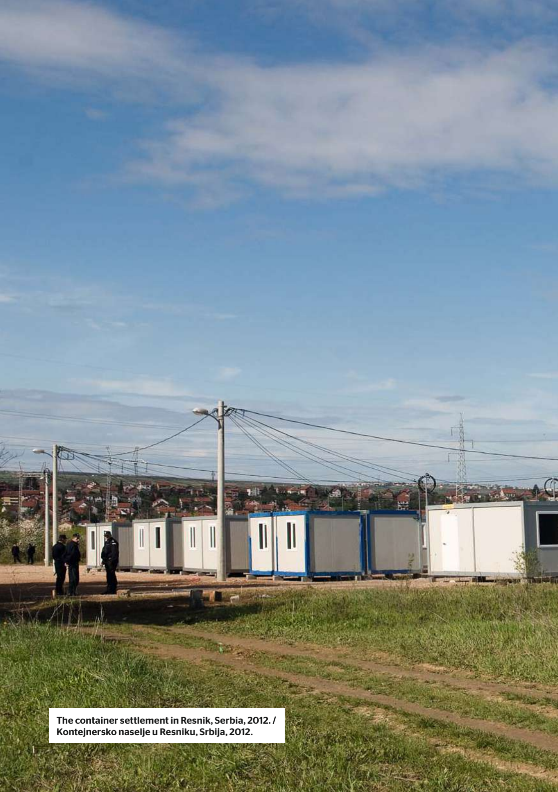
The container settlement in Resnik, Serbia, 2012. / Kontejnersko naselje u Resniku, Srbija, 2012.