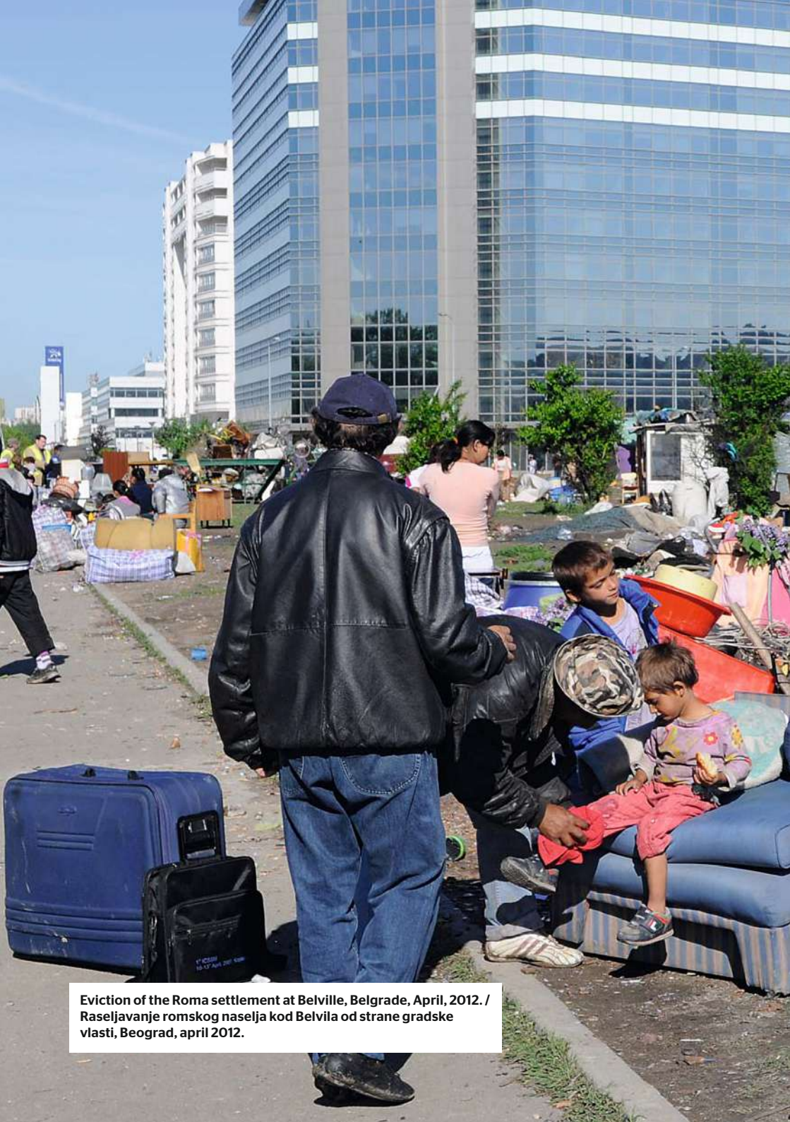
Eviction of the Roma settlement at Belville, Belgrade, April, 2012. / Raseljavanje romskog naselja kod Belvila od strane gradske vlasti, Beograd, april 2012.