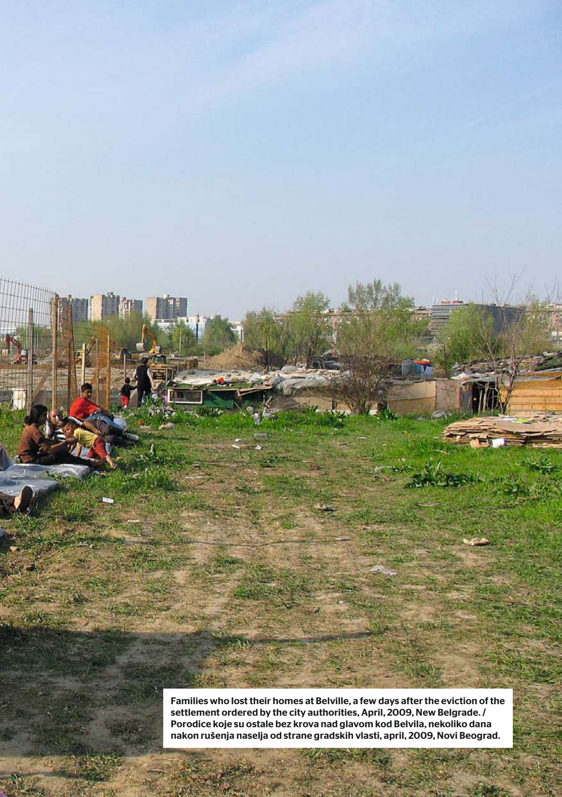
Families who lost their homes at Belville, a few days after the eviction of the settlement ordered by the city authorities, April, 2009, New Belgrade. / Porodice koje su ostale bez krova nad glavom kod Belvila, nekoliko dana nakon rušenja naselja od strane gradskih vlasti, april, 2009, Novi Beograd.