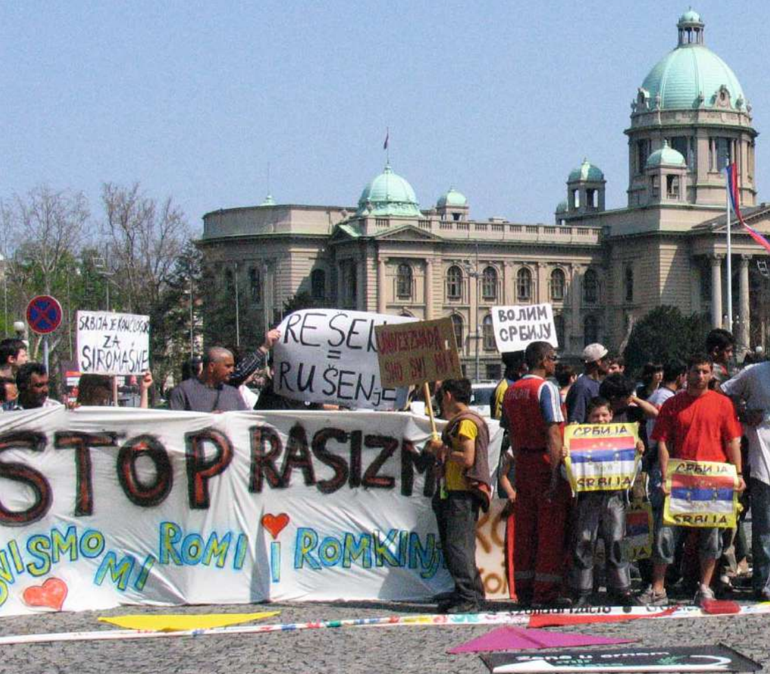
Protest in front of the Belgrade City Hall against the eviction of the Roma settlement at Belville, April 2009, Belgrade. / Protest ispred Skupštine grada Beograda zbog rušenja romskog naselja kod Belvila, april 2009, Beograd.